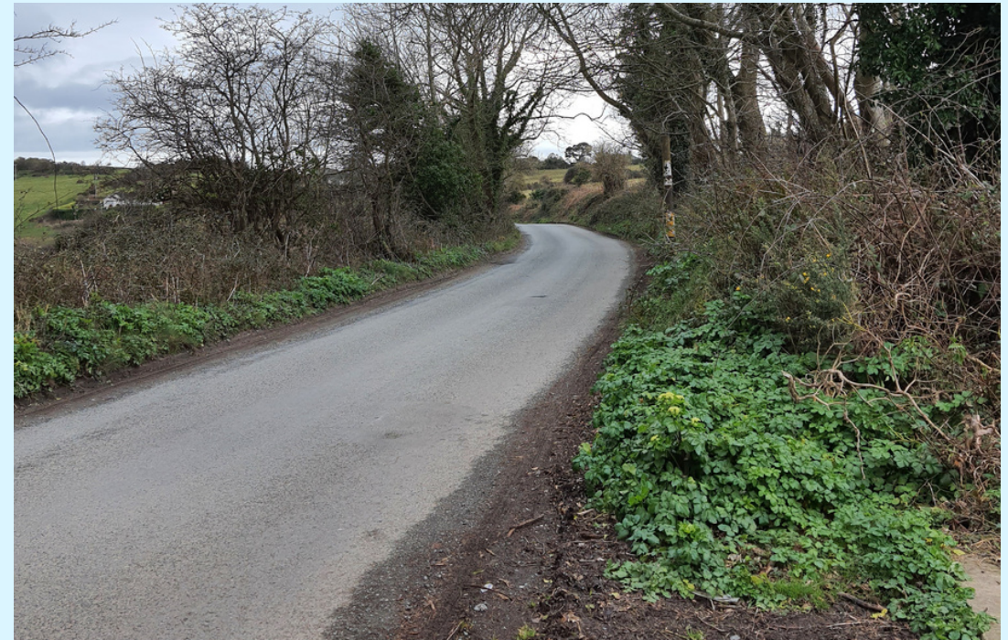
Figure 2 - Existing verge along the L-5103